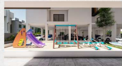
an artistic impression of nirvana crosstown kids play area view