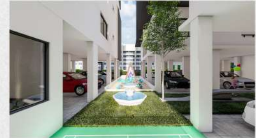
an arthistic impression of nirvana crosstown kids play area view